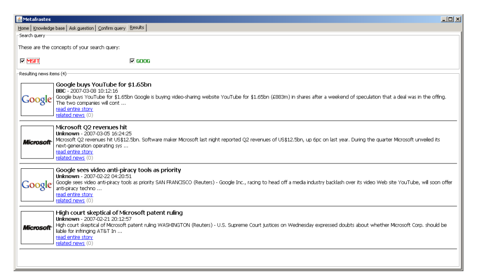
Fig. 6: Displaying the results in METAFRASTES