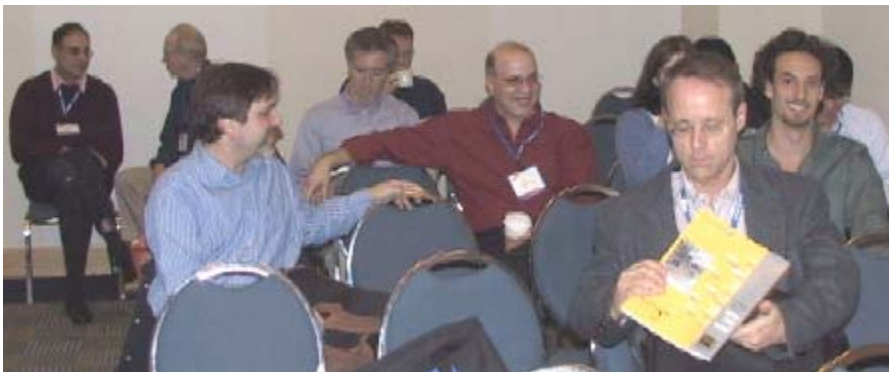
Two views of the audience that gathered for the DAS Awards session