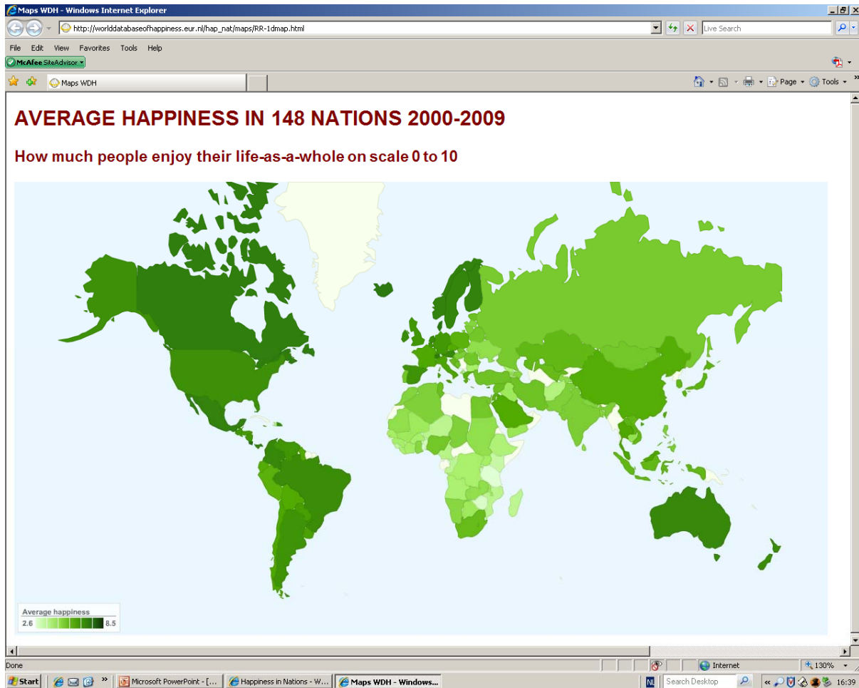
Figure 2 World map of happiness