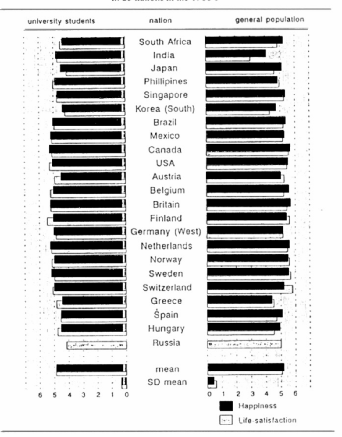
Level of Happiness in Nations Average scores on two items by students and general public in 23 nations in the 1980's

Data: Appendix A Correspondence of average happiness in student data and general population data: Happiness, r = +0.44 (p < 0.05), Life-satisfaction, r = +0.56 (p < 0.01)