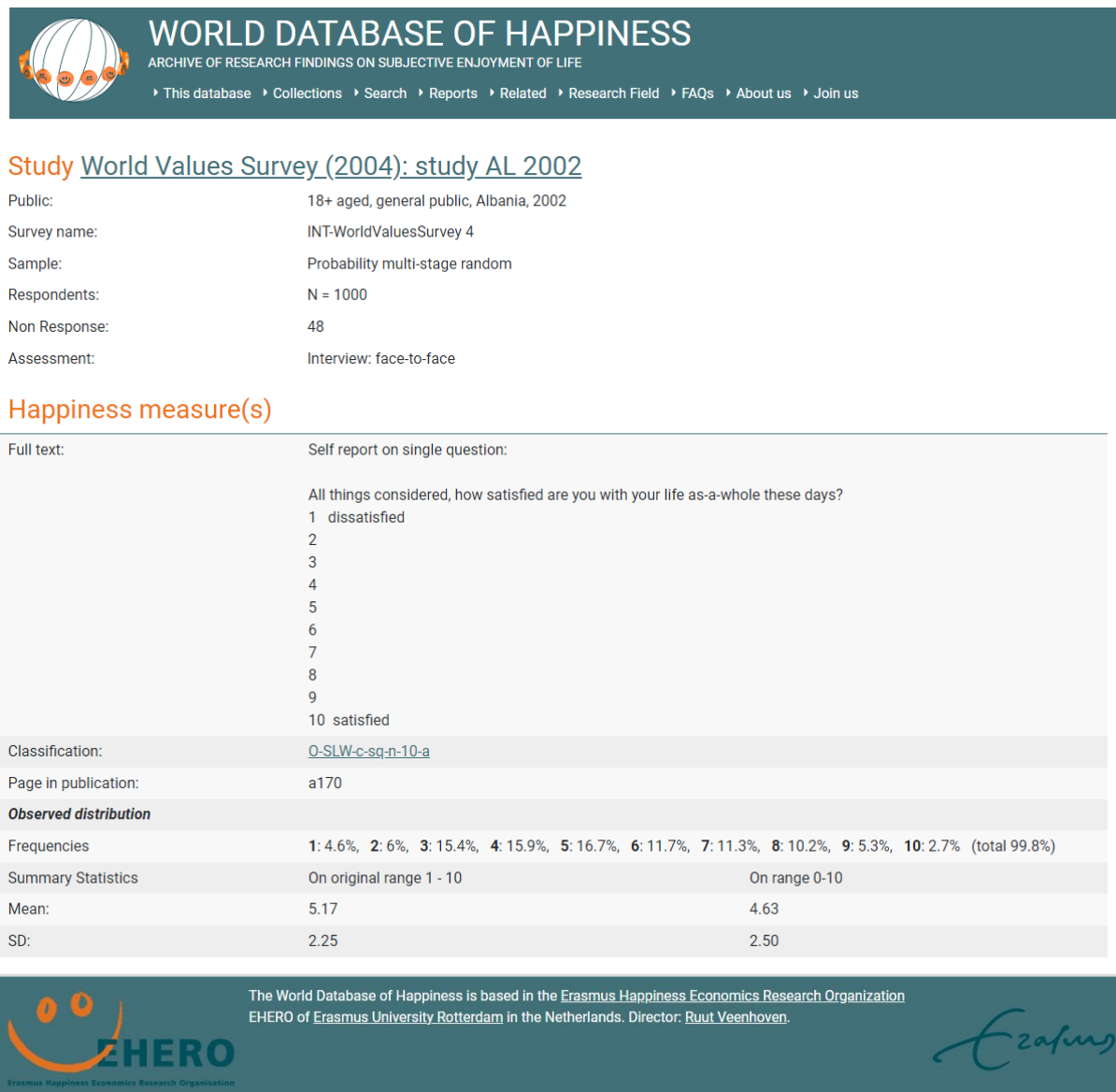
Figure 2 Example of a finding page in the World Database of happiness

URL: https://worlddatabaseofhappiness.eur.nl/distributional-findings/world-values-survey-2004-study-al-2002-4457/