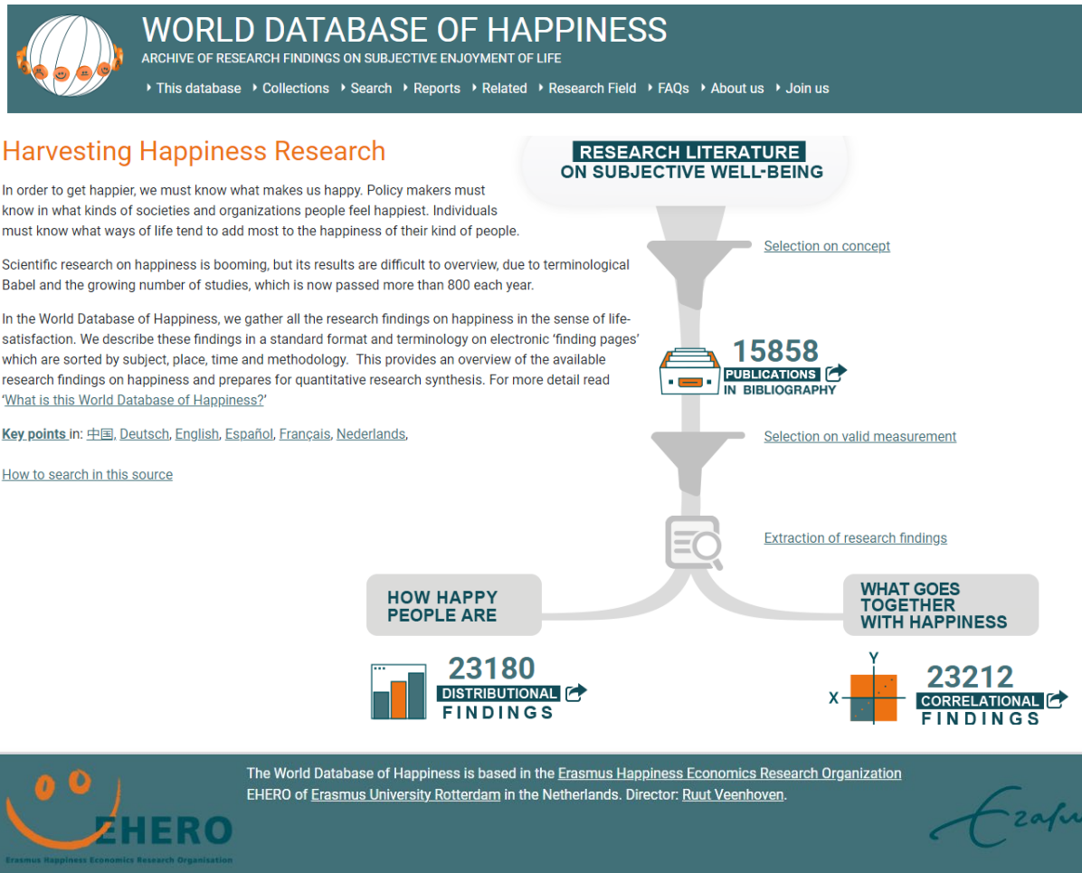
Figure 1 Start page of the World Database of Happiness

URL: https://worlddatabaseofhappiness.eur.nl